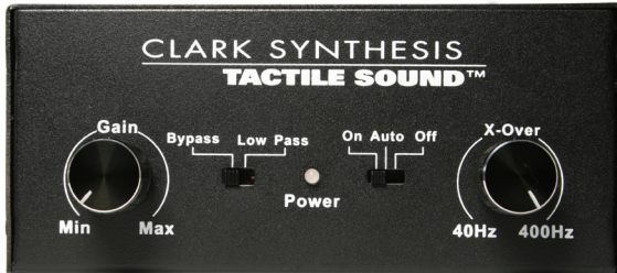
Wired Remote Control Interface

5 in W (127 mm) x 2.125 in H (54 mm) x 2 in D (50 mm)